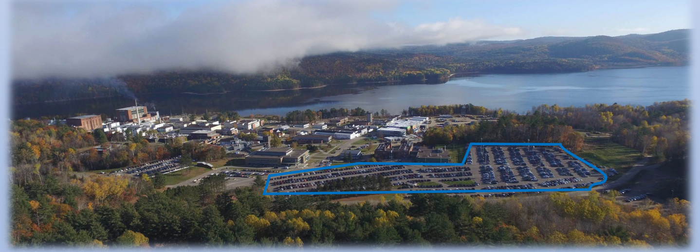
The Chalk River Laboratories site